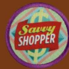
Junior Savvy Shopper