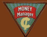
Brownie Money Manager