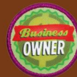
Junior Business Owner